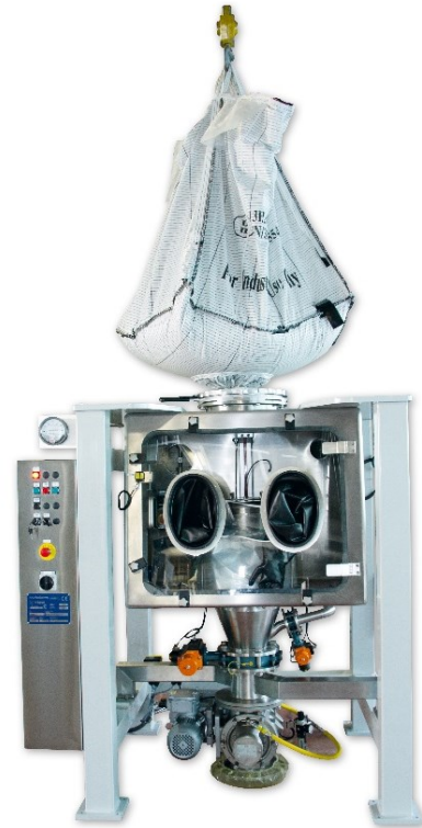
big-bag emptying with glove-box