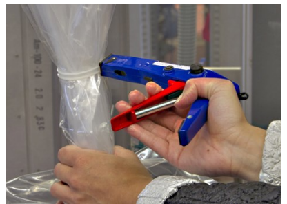
Insert the cable tie end into the gripper head and pull it tight with the hand lever