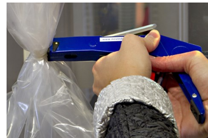
Press the button and pull the hand lever to cut the cable tie