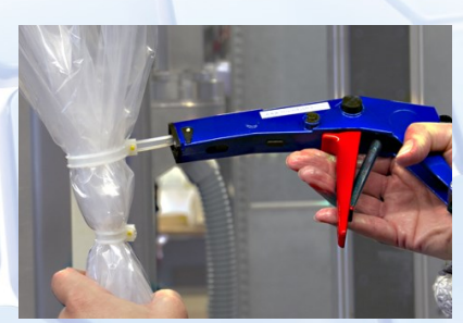
Place a second cable tie, pull it tight and cut its end