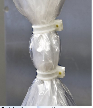
Cable ties correctly applied