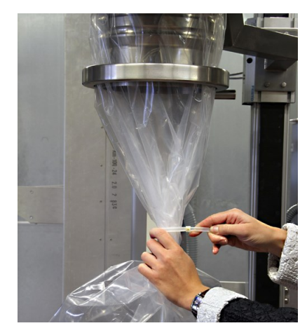
Form the endless foil, place a cable tie and pull it manually