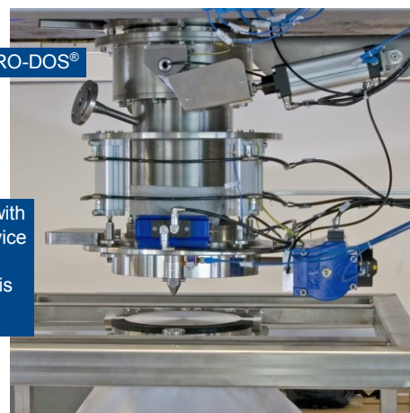
Open fill head with lifted upper valve part, both valve halves are closed.

Active flap (above) with pneumatic lifting device Passive flap (below) is part of the container