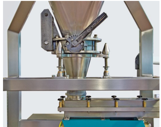
Connection of the product container to the dosing channel.